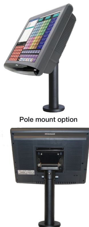
Pole mount option